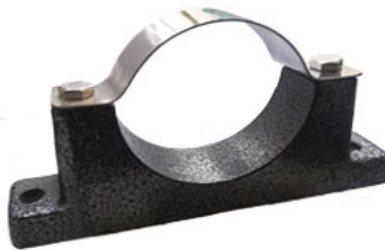
Cable clamp one way