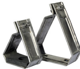
Steel cable clamp