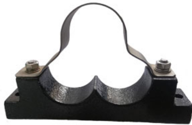
Cable clamp with aluminum saddle