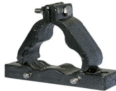
Cable clamp aluminum