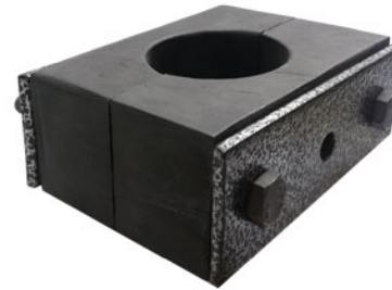
Polymer cable clamp